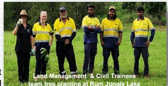
Land Management & Civil Trainees team tree planting at Rum Jungle Lake

We would like to thank all businesses and organisations that have provided their time and resources to provide meaningful training opportunities for the Rum Jungle Project trainees and staff.