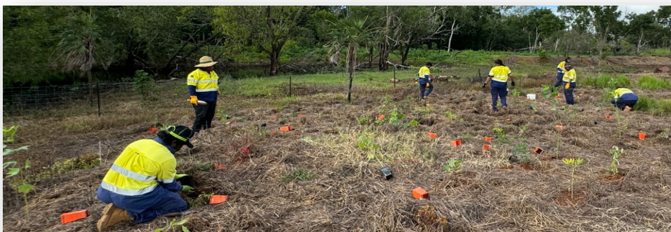
Civil Trainees planting tube stock native trees